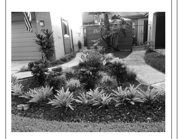
Garden of the Month October 2019 454 and 456 Meadowood Blvd

Dress up (or not) bring the kiddos (or just yourself), a dish to share for 8 or so, some candy for the kids, your own beverage, a lawn chair or something to sit on and meet your friends and neighbors for a not so scary but relaxing fun night.