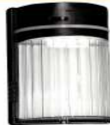
Model # 9012 - Brown $31.00 + tax + $7.00 Ship

You can purchase at Home Depot You can order online @ www.lightsofamerica.com