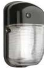
Model # OWP3 42F 120 P LP BZ $39.97 + tax

Since the office has been notified that the outdoor lights we listed have been discontinued, Chuck Fuller has found replacement lights which are listed below.